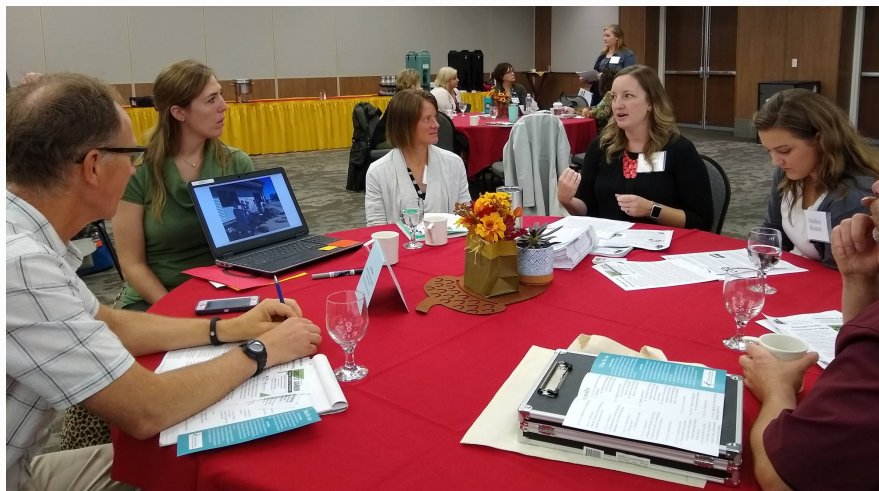
Newaygo County Commission on Aging