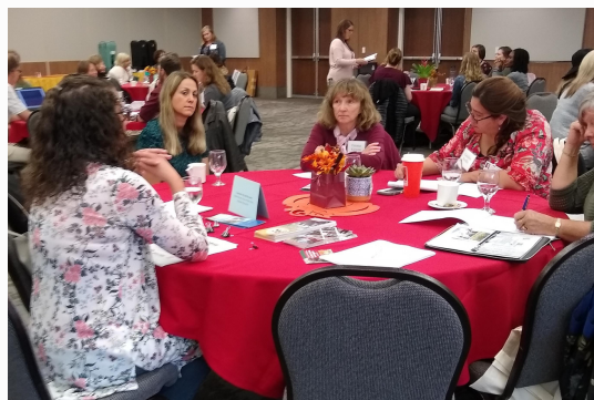
Big Rapids Parks and Rec