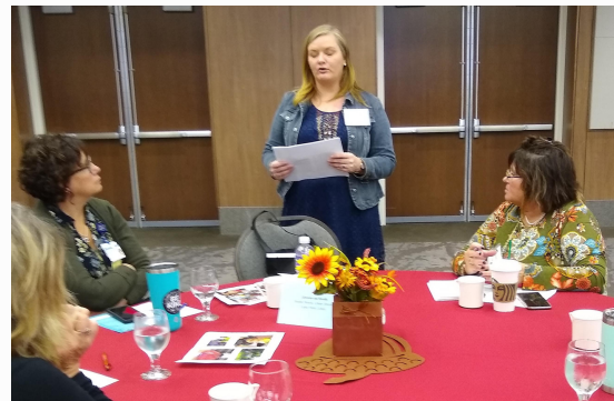
Luther Area Public Library