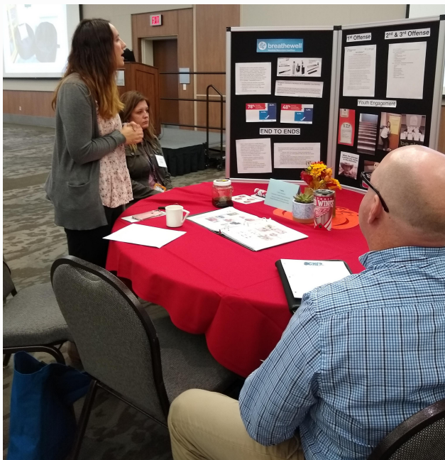
Breathewell Newaygo County