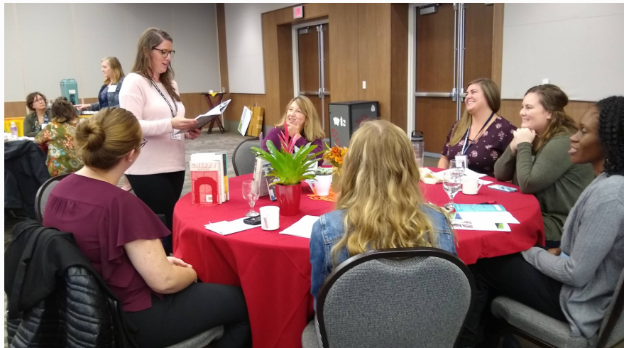
Mason County District Library