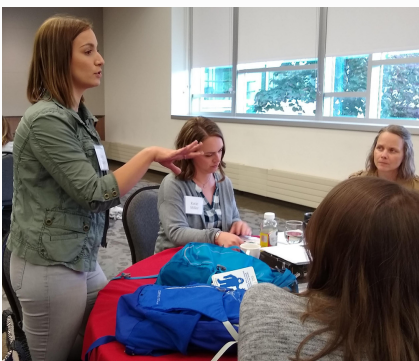
Grayling Parks and Rec